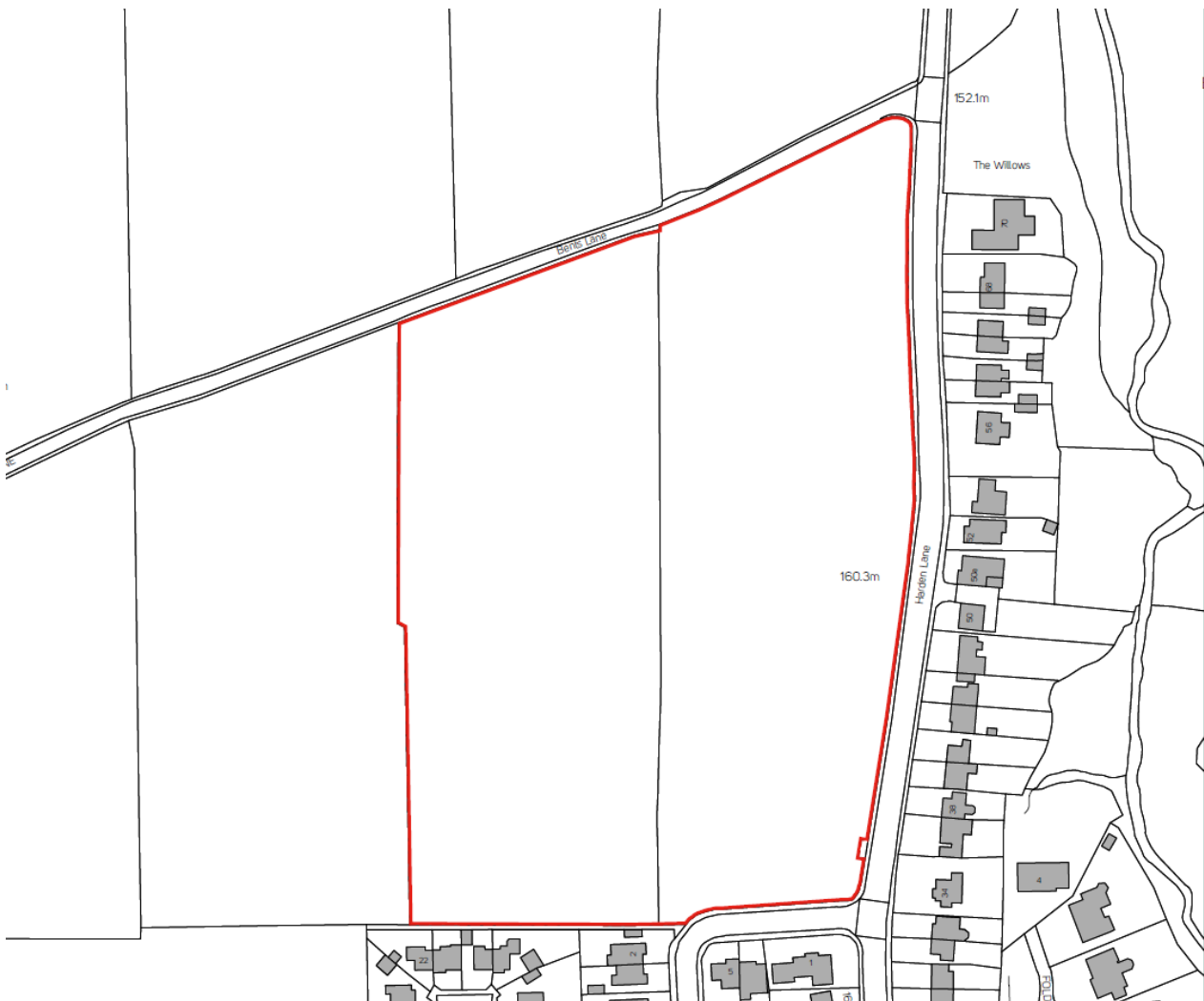
Figure 1 Site Location - Land west of Harden Lane / south of Bents Lane - Being promoted by Ptarmigan Land North

A plan showing the location of the site is set out below, and an initial masterplan accompanies this letter at Appendix 1. The masterplan has been carefully prepared to take into consideration local character and site features and is capable of accommodating in the order of 80-100 homes, alongside areas of publicly accessible open space and landscaping.